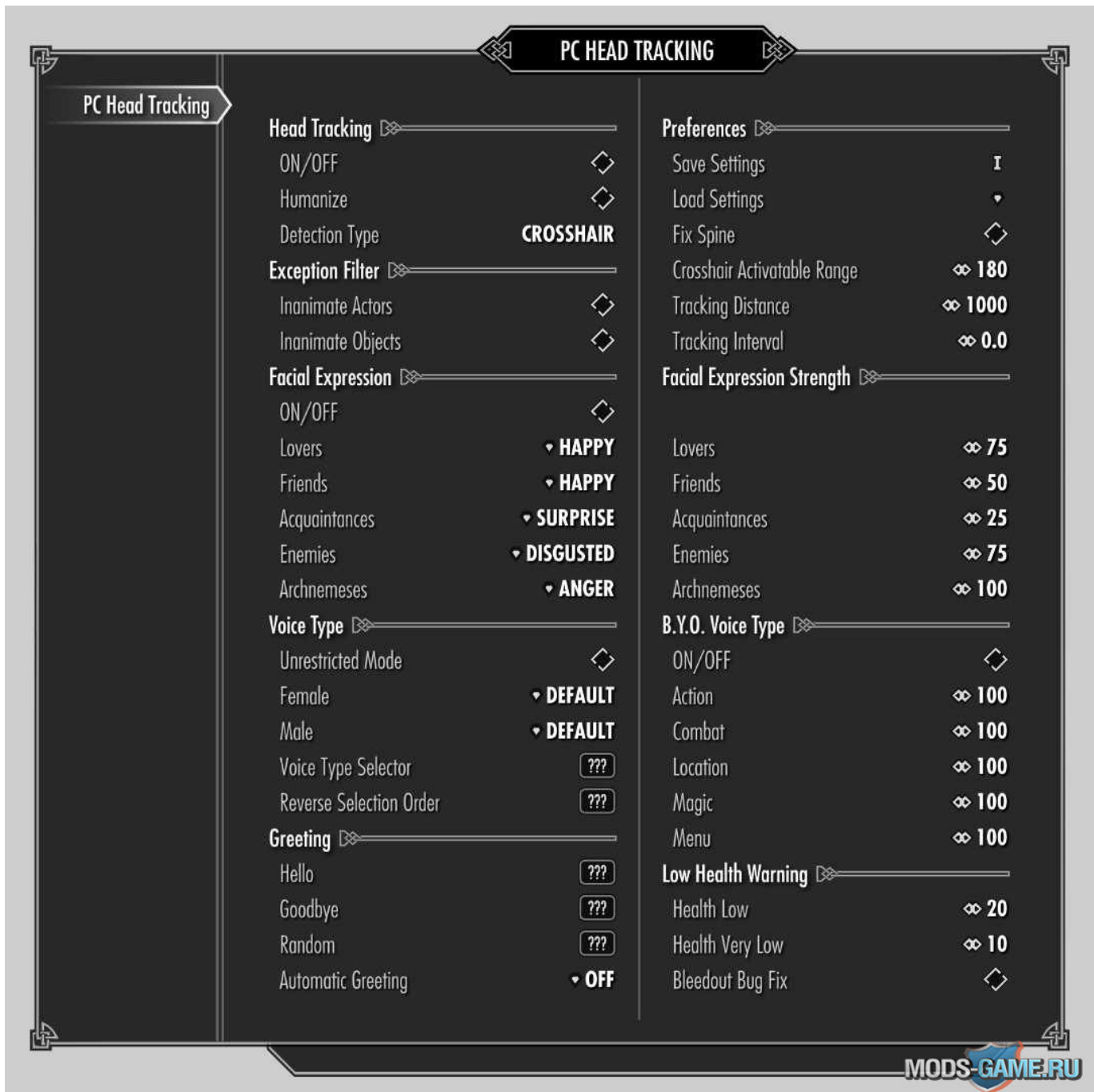
Skyrim Pc Head Tracking Voice Sets